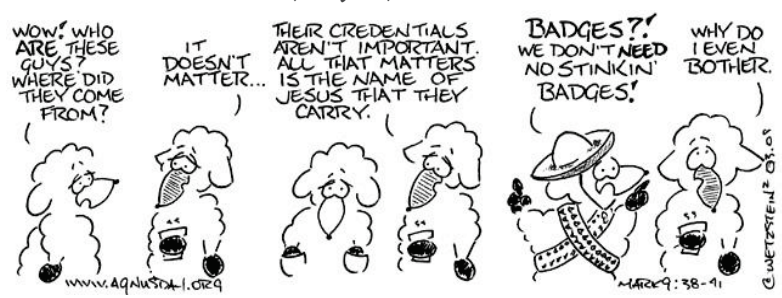
Agnus Day appears with the permission of www.agnusday.org